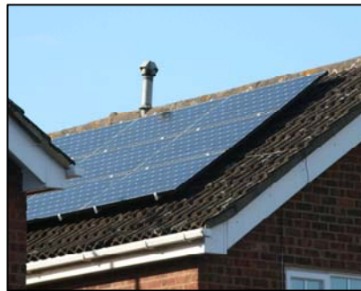
A 2.5kW peak Solar PV system

A 2.5kW peak system for a two person household could save/earn you £1000 a year and currently costs around £15,000 fitted. A new set up like this will reduce your annual CO 2 emissions by around a tonne. In terms of its positive environmental impact this is comparable to getting loft and cavity wall insulation fitted together.