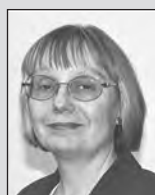
Dawn Pobjoy Youth & Community Committee