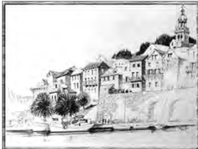
Peter Bowtell's Conte Crayon drawing of a Yugoslavian Village