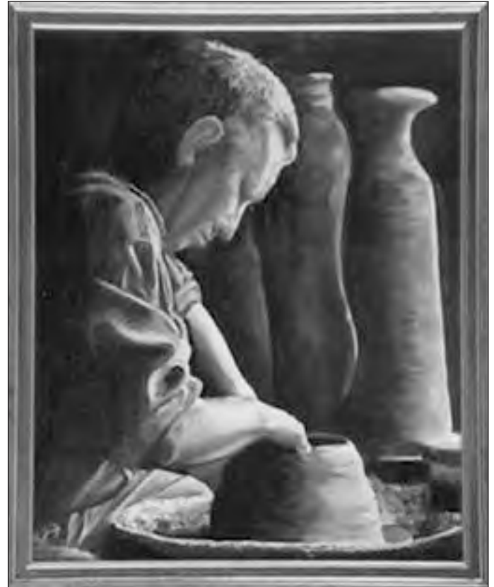
"The Potter", an oil painting by Jim Hall