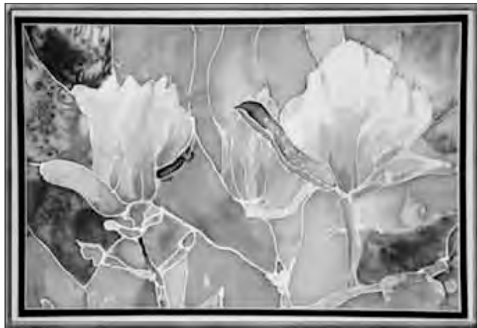
A silk painting by Celia Keech